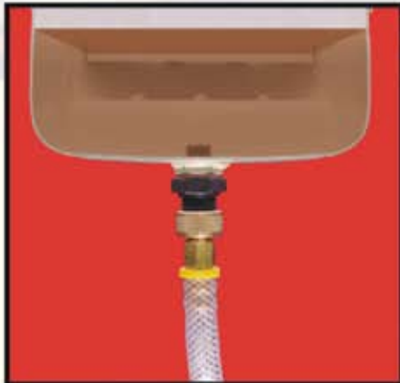
QC Coupler Tool ready to be attached