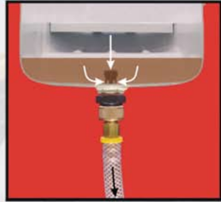
Oil Pan being emptied thru QC Coupler Tool