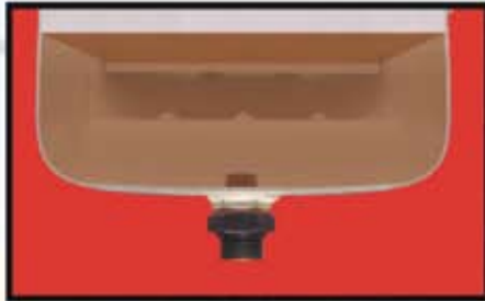
QC Coupler with safety cap removed