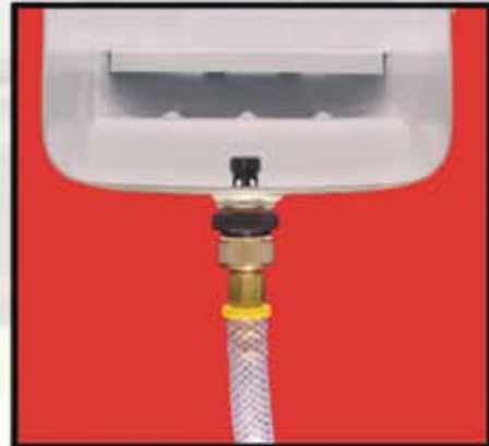
Oil Pan emptied and tool still in place