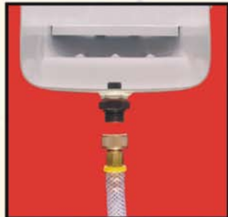
Tool removed and the valve has automatically closed