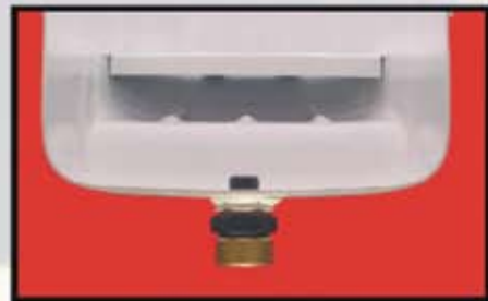
Safety Cap now back in place. Oilpan is now ready to be refilled.